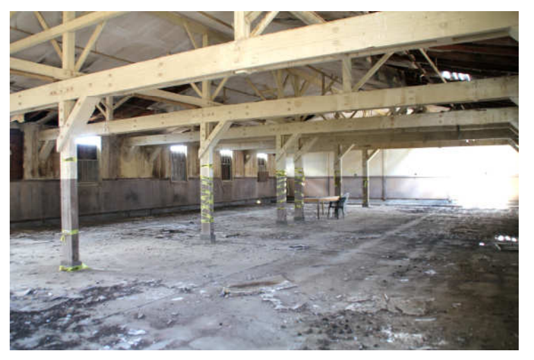
Typical interior of the Camp Lockett stable buildings. The structure is sound but there is a lot of deferred maintenance.